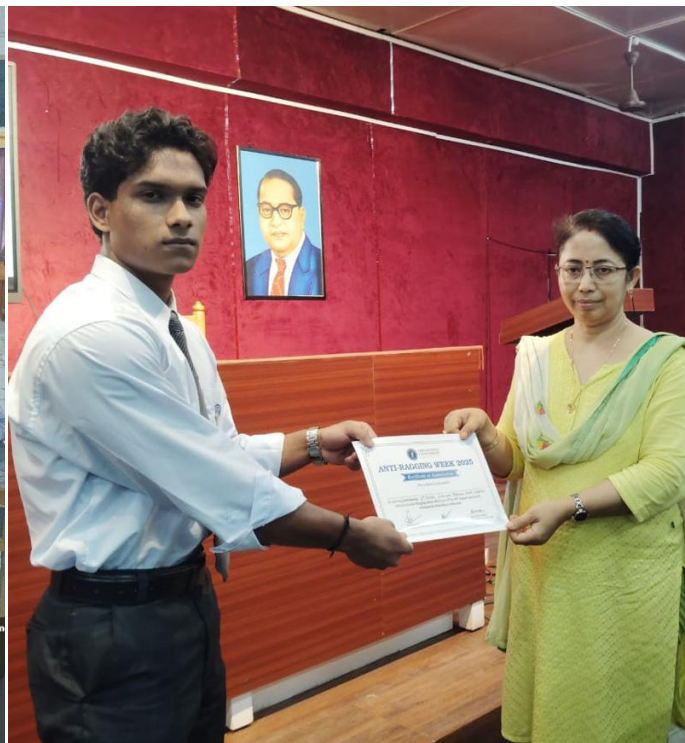
14-08-2025 - Ice-breaking Session