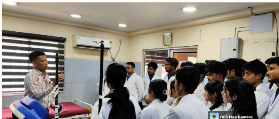
BMLT and MMLT students gain practical exposure and learning at Marwari Maternity Hospital.