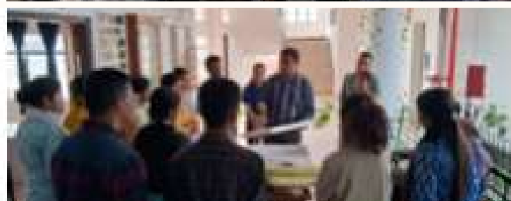
Few glimpses from the workshop.