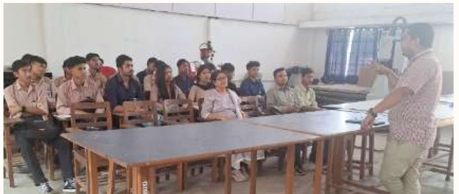
AEI students engaging in learning emerging technologies at AICTE IDEA-Lab.