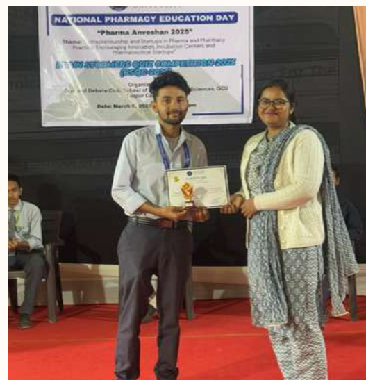
Winners of the BSQC-2025 receiving their awards of appreciation.