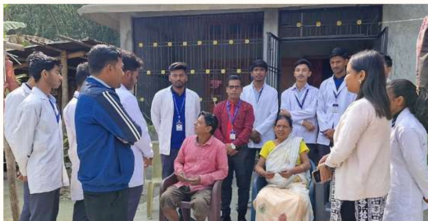
Community Health Initiative: Household Survey on Medicine Use and Common Ailments.