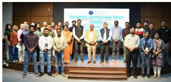
Pharma Anveshan being observed by School of Pharmaceutical Sciences at GCU Tezpur (left) and GCU Guwahati.