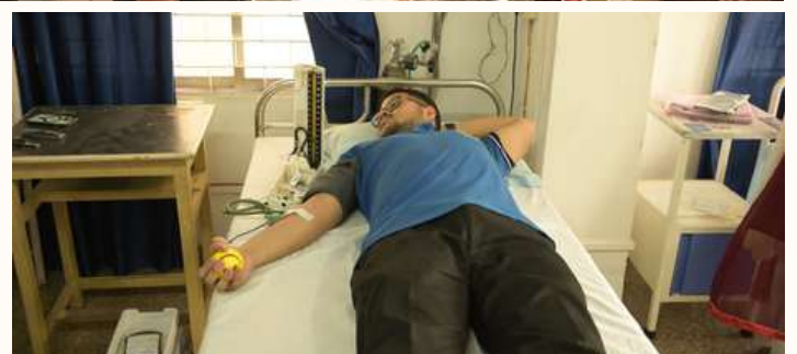
Drops of Hope: Volunteers donating blood for a noble cause.