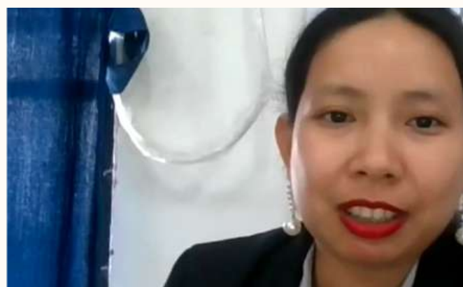
Glimpses from the online workshop.