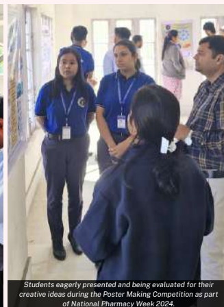
Students eagerly presented and being evaluated for their creative ideas during the Poster Making Competition as part of National Pharmacy Week 2024.