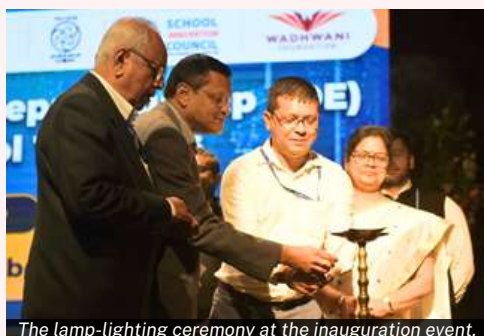
The lamp-lighting ceremony at the inauguration event.