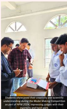
Students showcased their creativity and scientific understanding during the Model Making Competition as part of NPW 2024, impressing judges with their ingenuity and hard work.

The 63rd National Pharmacy Week not only emphasized the pivotal role of pharmacy in healthcare but also inspired students to actively engage with the community and environment. The events provided a platform for students to demonstrate their creativity, innovation, and teamwork while reinforcing the values of social responsibility and environmental consciousness. The week concluded with a prize distribution ceremony, where the winners of the various competitions were recognized and applauded for their outstanding contributions.