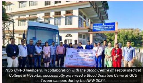
NSS Unit-3 members, in collaboration with the Blood Centre of Tezpur Medical College & Hospital, successfully organized a Blood Donation Camp at GCU Tezpur campus during the NPW 2024.