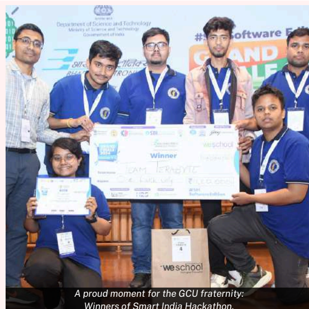
A proud moment for the GCU fraternity: Winners of Smart India Hackathon.

Smart India Hackathon offers a dynamic platform for students across India to address real-world challenges through innovative technological solutions. Organized annually by the All India Council for Technical Education (AICTE), the hackathon attracts thousands of teams from various universities and colleges, who are tasked with solving problem statements presented by government ministries, industries, and academic institutions. These problems spanned a wide range of sectors, including healthcare, agriculture, education, urban development, and more, encouraging students to develop solutions with tangible impact. This year, a total of 254 problem statements were provided.