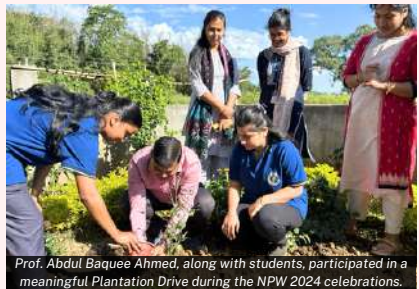
Prof. Abdul Baquee Ahmed, along with students, participated in a meaningful Plantation Drive during the NPW 2024 celebrations.