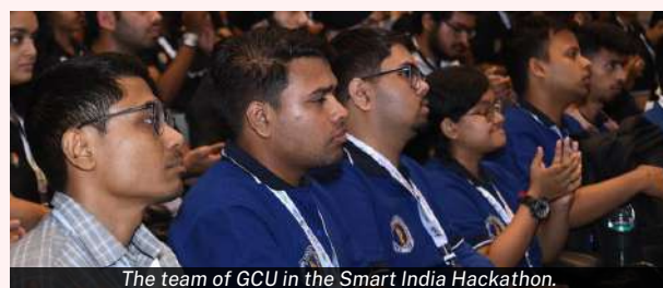
The team of GCU in the Smart India Hackathon.