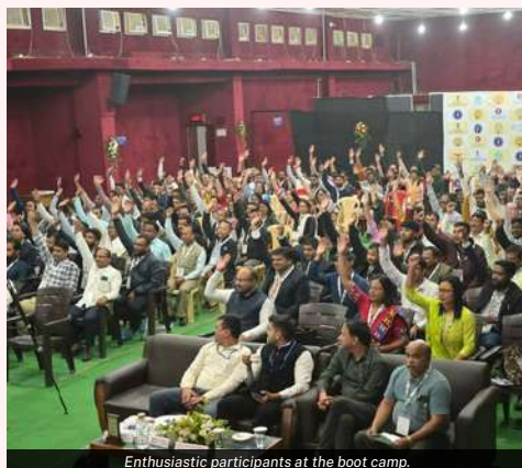
Enthusiastic participants at the boot camp.