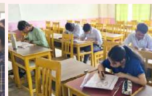
Students showcased their artistic talents during the Art Competition as part of the NPW 2024 celebrations.