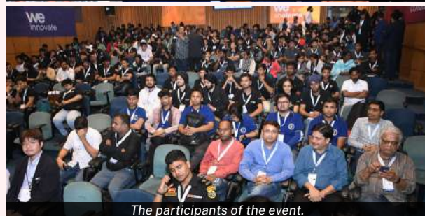
The participants of the event.

The GCU team's project, "Conversational Image Recognition Chatbot", developed for Bharat Electronics Limited (BEL), was lauded for its innovative features, including targeted object detection, multilingual support, speech-to-text conversion, customizable user settings, and chat history continuity. Competing against 465 shortlisted teams under BEL's problem statement, only five, including GCU's team, were selected for the final round. The other four finalists comprised of teams from Indian Institute of Technology, Kharagpur, Atal Bihari Vajpayee Indian Institute of Information Technology and Management, Gwalior, Vivekanand Education Society's Institute of Technology, Mumbai, and, JCT College of Engineering and Technology, Coimbatore.