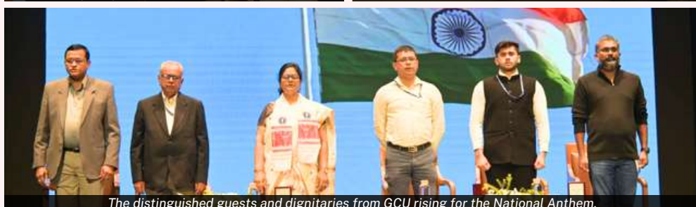
The distinguished guests and dignitaries from GCU rising for the National Anthem.