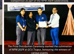
The Prize Distribution Ceremony marked the culmination of NPW 2024 at GCU Tezpur, honouring the winners of various events.