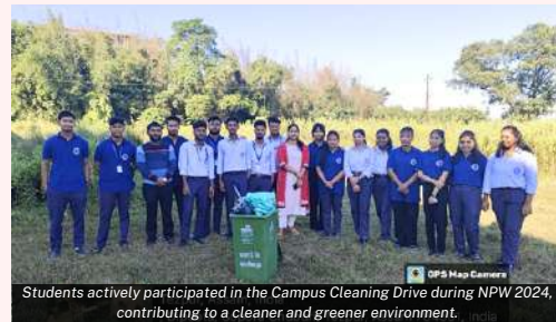
Students actively participated in the Campus Cleaning Drive during NPW 2024, contributing to a cleaner and greener environment.

The 63rd National Pharmacy Week not only emphasized the pivotal role of pharmacy in healthcare but also inspired students to actively engage with the community and environment. The events provided a platform for students to demonstrate their creativity, innovation, and teamwork while reinforcing the values of social responsibility and environmental consciousness. The week concluded with a prize distribution ceremony, where the winners of the various competitions were recognized and applauded for their outstanding contributions.