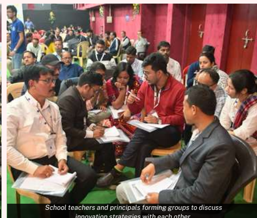
School teachers and principals forming groups to discuss innovation strategies with each other.