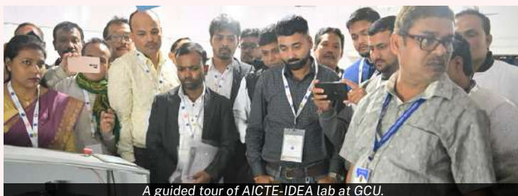
A guided tour of AICTE-IDEA lab at GCU.