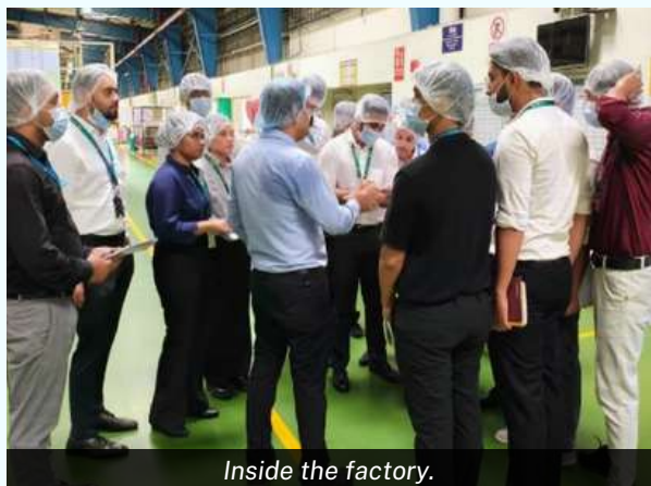
Inside the factory.