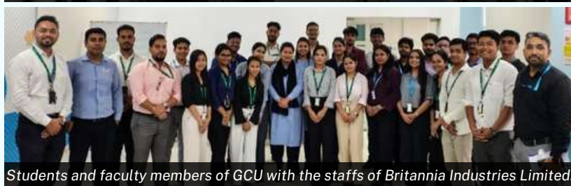
Students and faculty members of GCU with the staffs of Britannia Industries Limited.