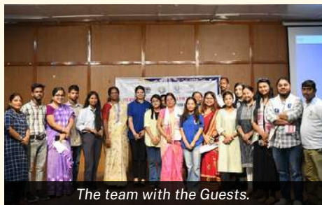
The team with the Guests.