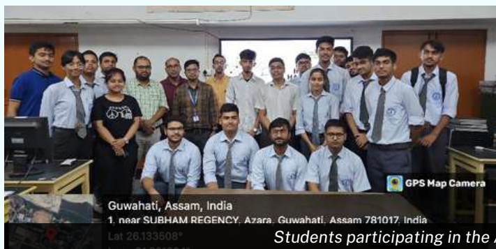
Guwahati, Assam, India 1, near SUBHAM REGENCY, Azara, Guwahati, Assam 781017, India Lat 26.133508° Long 91.621956°

SIH Internal Hackathon: An Internal Hackathon for the AICTE-Smart India Hackathon 2024 was organized by the Coding Club at Girijananda Chowdhury University (GCU), Guwahati, Assam, on the September 14, 2024. The Internal Hackathon serves as a preliminary round for the AICTE-Smart India Hackathon (SIH), where they will compete against the brightest minds from across the country in solving complex societal and industrial challenges. The internal hackathon not only gave students the opportunity to focus on problem-solving and creativity, but it also fostered an innovative environment for students to showcase their technical skills. The students worked on a variety of problem statements, which were obtained from top-tier organizations such as DRDO, Bharat Electronics Limited (BEL), and the Indian National Center for Ocean Information Services (INCOIS).