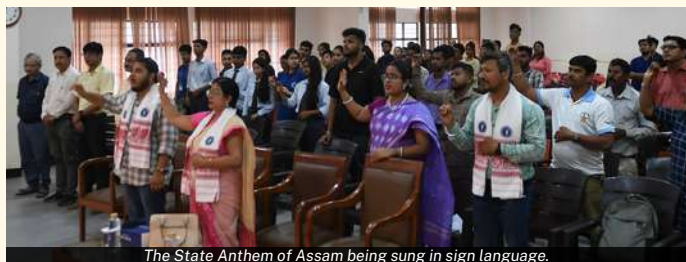
The State Anthem of Assam being sung in sign language.