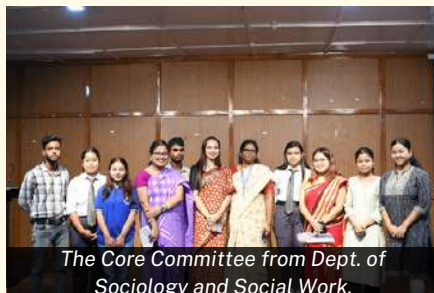
The Core Committee from Dept. of Sociology and Social Work.