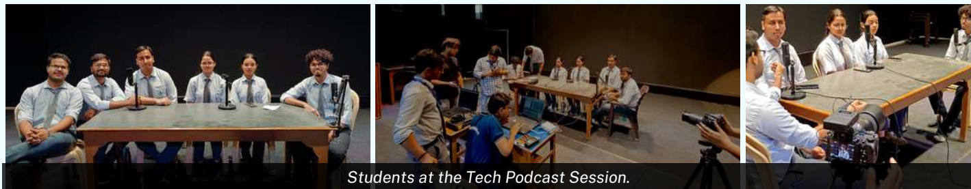
Students at the Tech Podcast Session.

SIH Internal Hackathon: An Internal Hackathon for the AICTE-Smart India Hackathon 2024 was organized by the Coding Club at Girijananda Chowdhury University (GCU), Guwahati, Assam, on the September 14, 2024. The Internal Hackathon serves as a preliminary round for the AICTE-Smart India Hackathon (SIH), where they will compete against the brightest minds from across the country in solving complex societal and industrial challenges. The internal hackathon not only gave students the opportunity to focus on problem-solving and creativity, but it also fostered an innovative environment for students to showcase their technical skills. The students worked on a variety of problem statements, which were obtained from top-tier organizations such as DRDO, Bharat Electronics Limited (BEL), and the Indian National Center for Ocean Information Services (INCOIS).