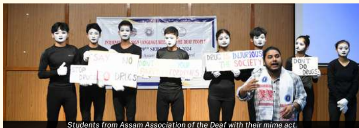
Students from Assam Association of the Deaf with their mime act.