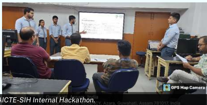
Guwahati, Assam, India 1, near SUBHAM REGENCY, Azara, Guwahati, Assam 781017, India Lat 26.133501° Long 91.621956°