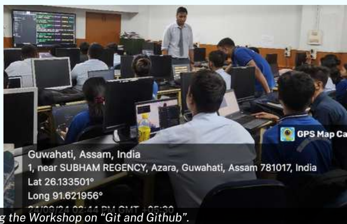
Guwahati, Assam, India 1, near SUBHAM REGENCY, Azara, Guwahati, Assam 781017, India Lat 26.133501° Long 91.621956° 24/09/24 02:44 PM GMT+05:30