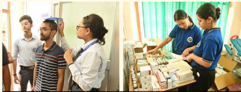
Faculty member and students providing free consultations and addressing the healthcare needs of the local community.

The health camp allowed students from both schools to apply their academic knowledge in real-world healthcare scenarios while also instilling a sense of social responsibility, in line with the objectives of the NSS. By offering free consultations and distributing essential medications, the camp directly addressed the healthcare needs of the local community while raising awareness about the pharmacists' role beyond medication dispensing. The event also served as an excellent platform for promoting preventive healthcare and fostering community engagement, drawing a substantial turnout of hundreds from the local population who benefited from the services. Through this collaborative effort, the University reaffirmed its commitment to public health and education, contributing meaningfully to the spirit of World Pharmacists Day. The university extends its gratitude to the Department of Health Services (DHS), Government of Assam, for their valuable support in providing free essential generic medicines, which ensured the smooth and successful execution of the health camp.