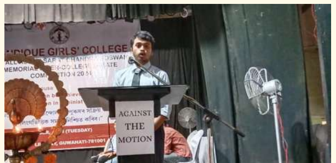
The august student actively participating in the debate competition.