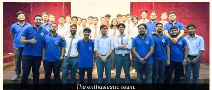
The enthusiastic team.