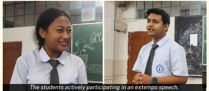
The students actively participating in an extempore speech.