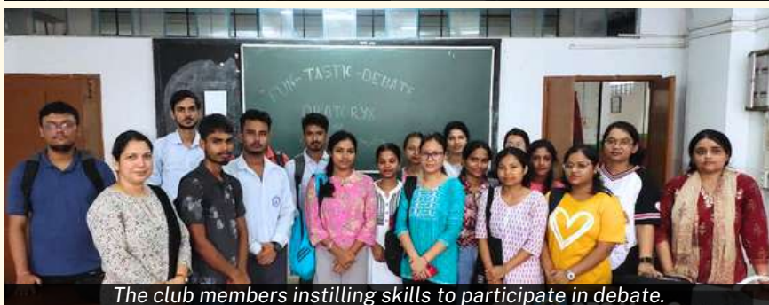
The club members instilling skills to participate in debate.

On 03 September 2024, The Club organized Fun-Tastic Debate on topics like 'Should video games be considered as sport?', 'Is it better to be a night owl than an early bird?', 'Is it better to live without the internet or without TV?' etc. Students also shared their feeling towards the hobbies they are persuading.