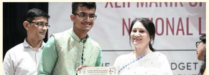
Glimpses from Oratoryx Club members participating in the 48th Manik Chandra Baruah Memorial National Level Debate Competition.