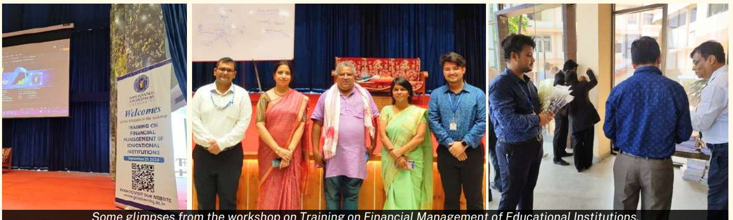
Some glimpses from the workshop on Training on Financial Management of Educational Institutions.