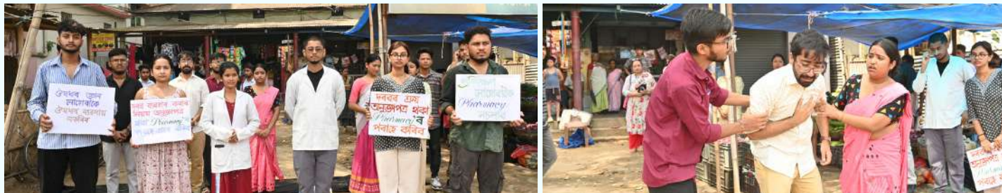
Students captivate the audience by their performance in a street play creating awareness about the role of pharmacists.