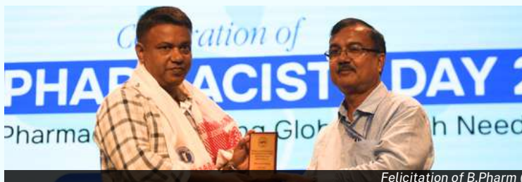
Felicitation of B.Pharm (Practice) students.