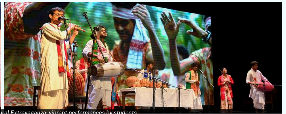
Cultural Extravaganza: vibrant performances by students.