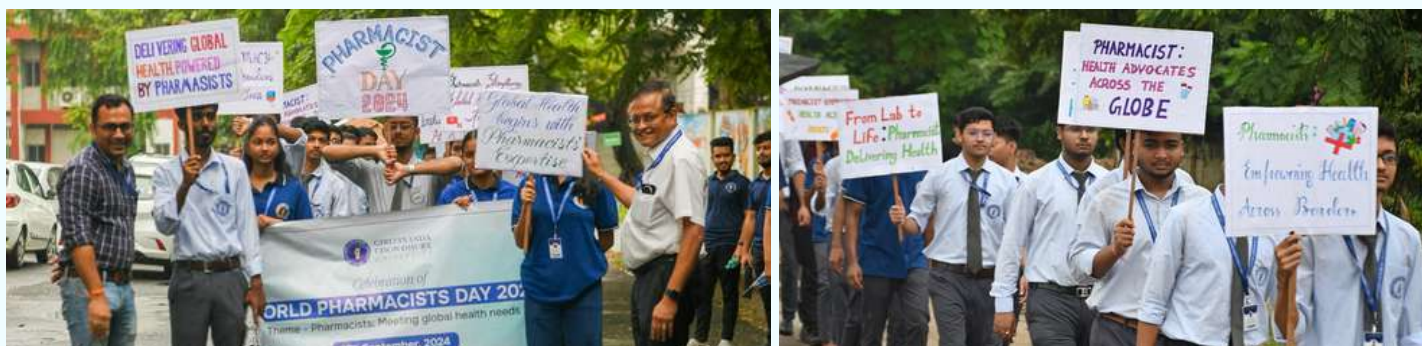
United for Healthcare: Students rally in celebration of Pharmacists' Day, championing the essential contributions of pharmacists to a healthier world.

Overall, the World Pharmacists Day celebrations at GCU were a resounding success. The events organized on this occasion served as a platform to showcase the valuable contributions of pharmacists to global health and to promote awareness about the importance of rational drug use. The university's commitment to promoting pharmaceutical education and research was evident throughout the celebrations.