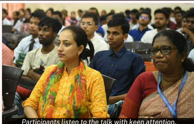
Participants listen to the talk with keen attention.