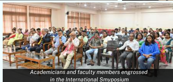
Academicians and faculty members engrossed in the International Symposium