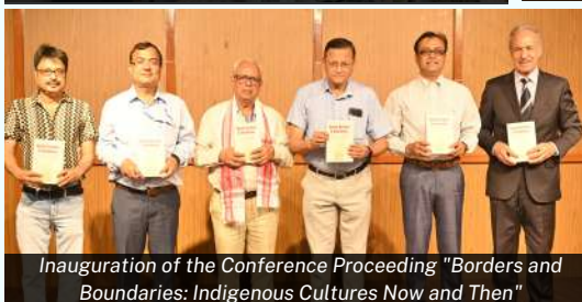
Inauguration of the Conference Proceeding "Borders and Boundaries: Indigenous Cultures Now and Then"