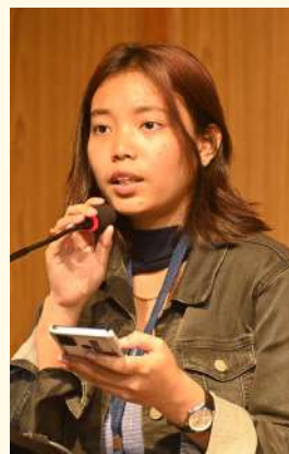
A glimpse of the recital session.