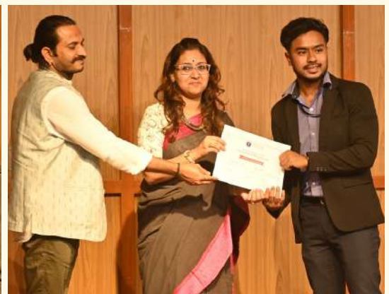
Distribution of certificates to the participants.