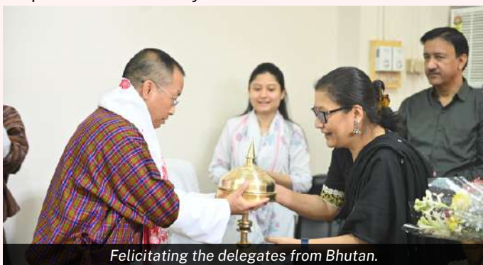
Felicitating the delegates from Bhutan.