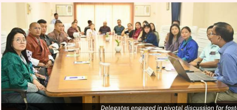
Delegates engaged in pivotal discussion for fostering academic excellence.