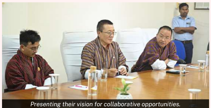
Presenting their vision for collaborative opportunities.