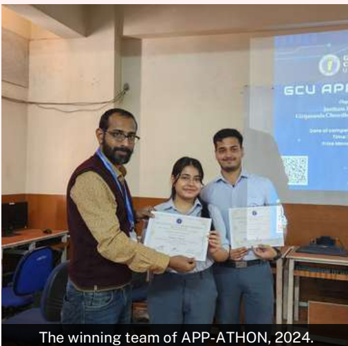
The winning team of APP-ATHON, 2024.