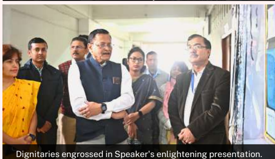
Dignitaries engrossed in Speaker's enlightening presentation.