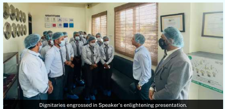
Dignitaries engrossed in Speaker's enlightening presentation.