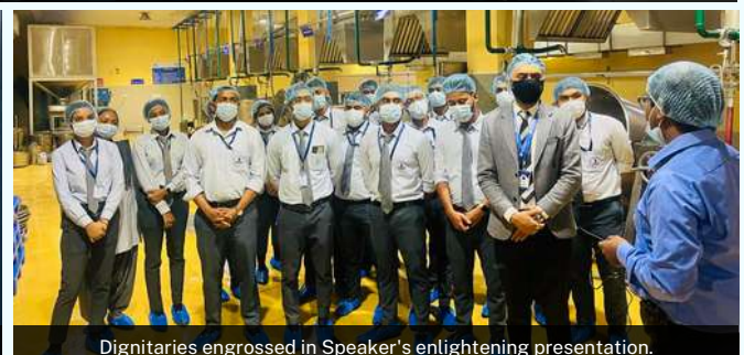
Dignitaries engrossed in Speaker's enlightening presentation.