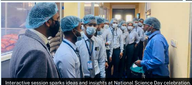
Interactive session sparks ideas and insights at National Science Day celebration.