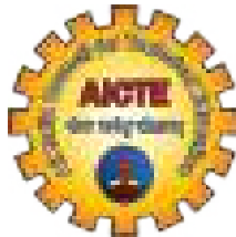
All India Council for Technical Education (AICTE)