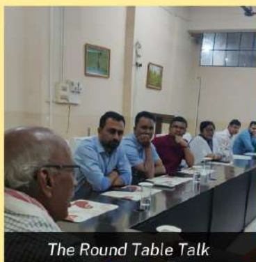
The Round Table Talk