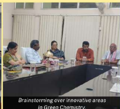
Brainstorming over innovative areas in Green Chemistry.