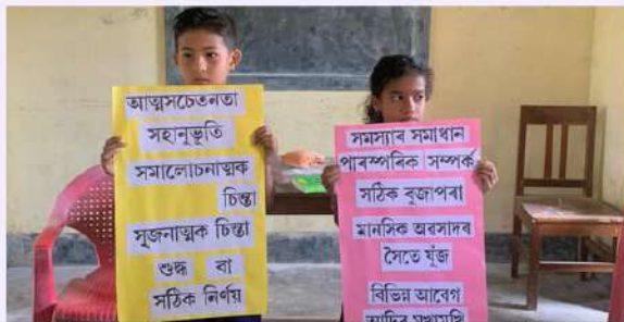
On their way of becoming better citizens of tomorrow.