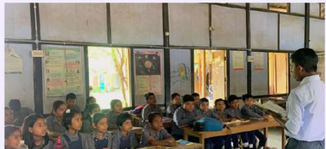
A workshop session underway.