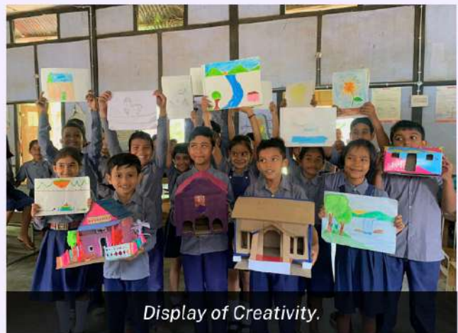
Display of Creativity.